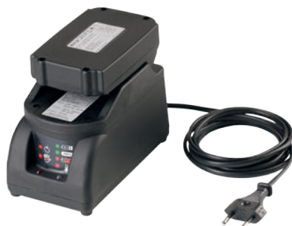
Fully recharged within 30 minutes.