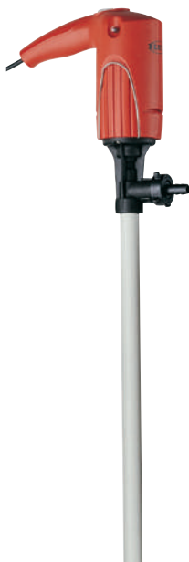
JUNIORFLUX F 310 (see page 4)