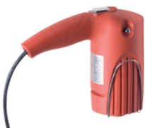
FEM 3070 (see page 5)