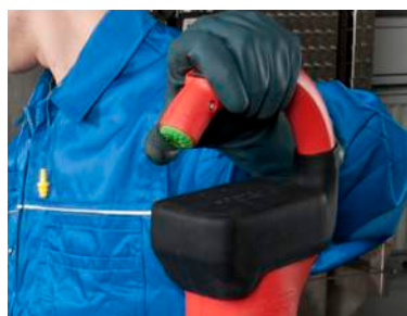
Variable delivery rate due to stepless speed adjustment.