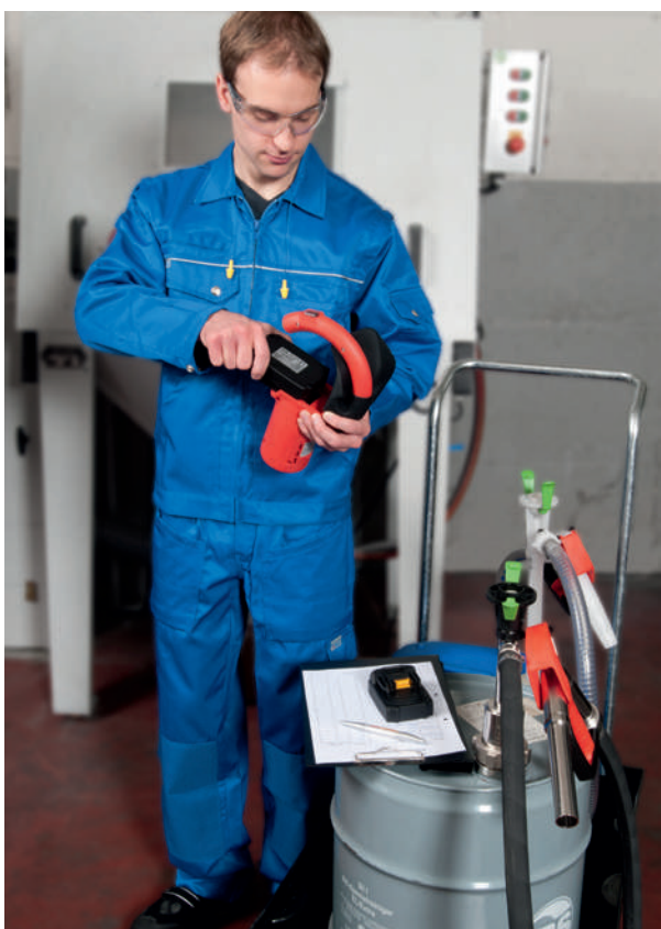
Minimal interruption of work due to replaceable battery.