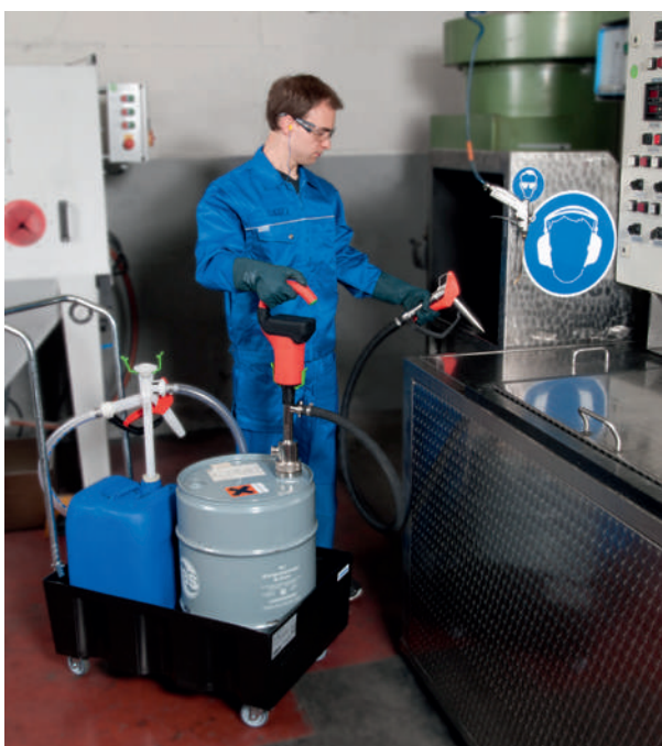
High mobility due to battery motor.