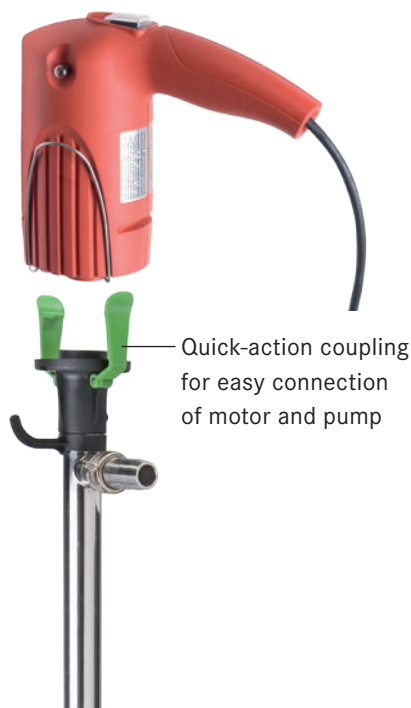
COMBIFLUX with FEM 3070

The small sealless drum pump COMBIFLUX FP 314 can be combined with the collector motor FEM 3070 (with mains connection). It is of a modular design, so that several pumps can be operated in series with one motor. Like the JUNIORFLUX, the COMBIFLUX is especially suitable for pumping comparably small quantities out of containers such as canisters or drums of up to 1 000 litre IBCs. The small outer tube diameter allows pumping even out of narrow openings.