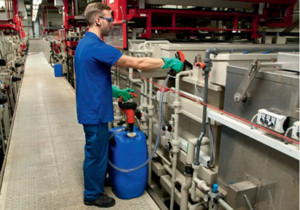
FBM-B 3100 battery motor – the solution where cables are problematic or not desired.