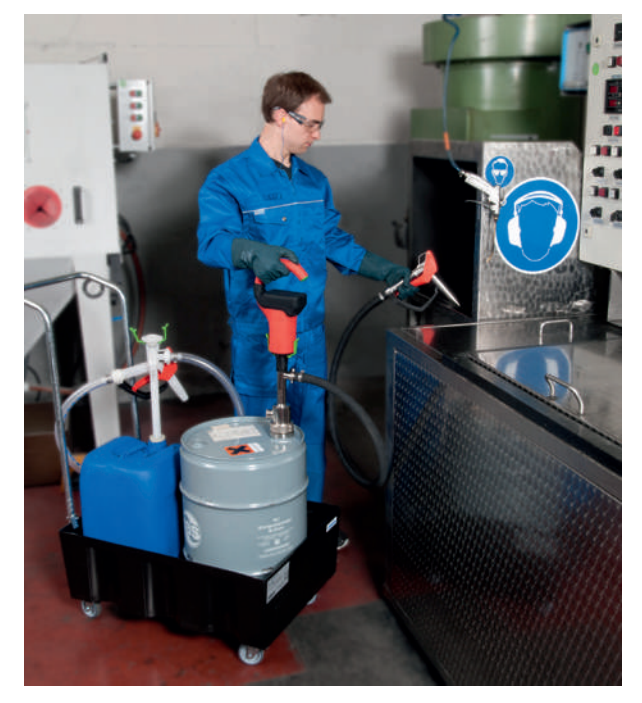
High mobility due to battery motor.