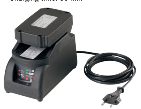
Fully recharged within 30 minutes.