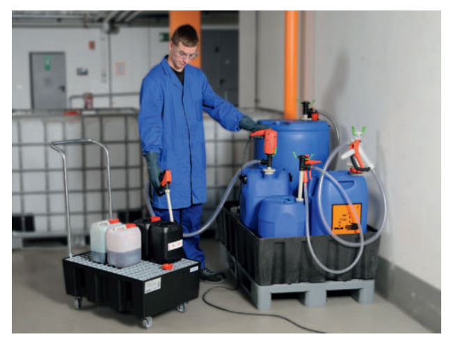
COMBIFLUX – Transferring of various fluids with several pumps and a tethered motor FEM 3070.