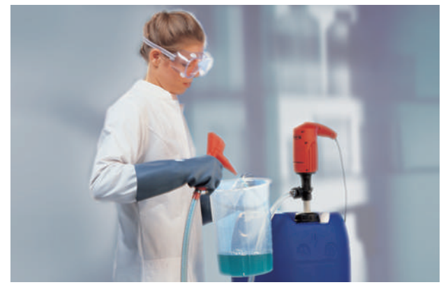
Transferring of small quantities with the JUNIORFLUX pump kit.

^{\star} measured at pump discharge with water (20 °C) depending on outer tube material.